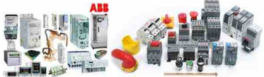
ABB is a global leader in power and automation technologies. Their solutions improve the efficiency, productivity and quality of their customers' operations while minimizing environmental impact. Innovation is at the forefront of what they do and many of the technologies that drive modern society were pioneered by ABB.